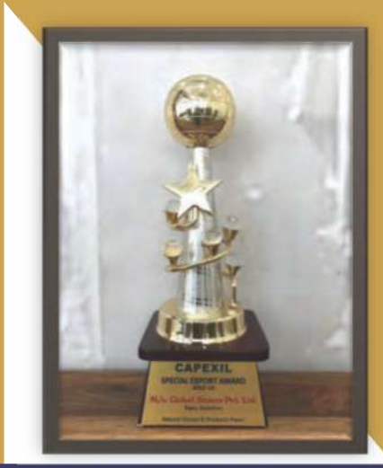
Special Export Award 2012