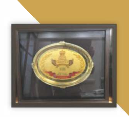
India s Small Giant Award 2016-17