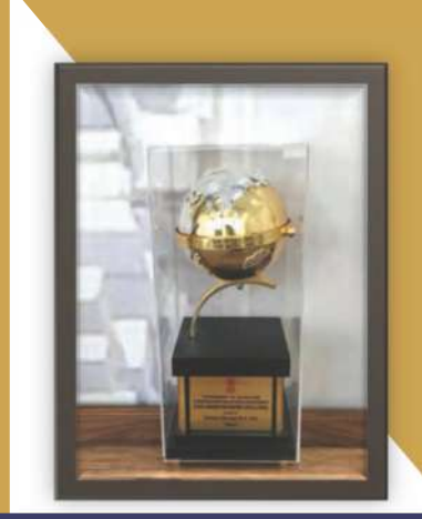
Rajasthan State Award for Export Excellence 2016-17