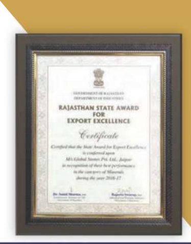
Rajasthan State Award for Export Excellence 2016-17