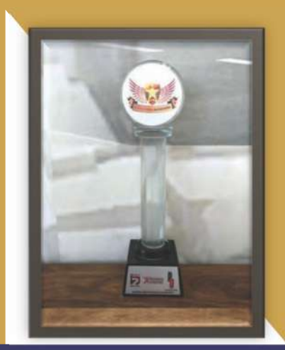
Worldwide Achievers 2016