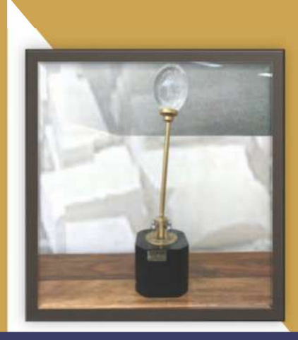
International Trophies & Co.