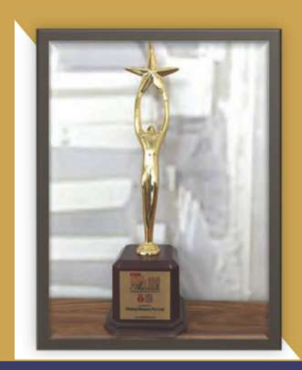
India s SME Awards 2015-16