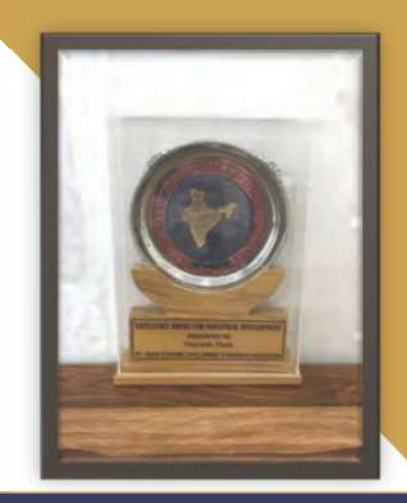
Excellence Award for Industry Development